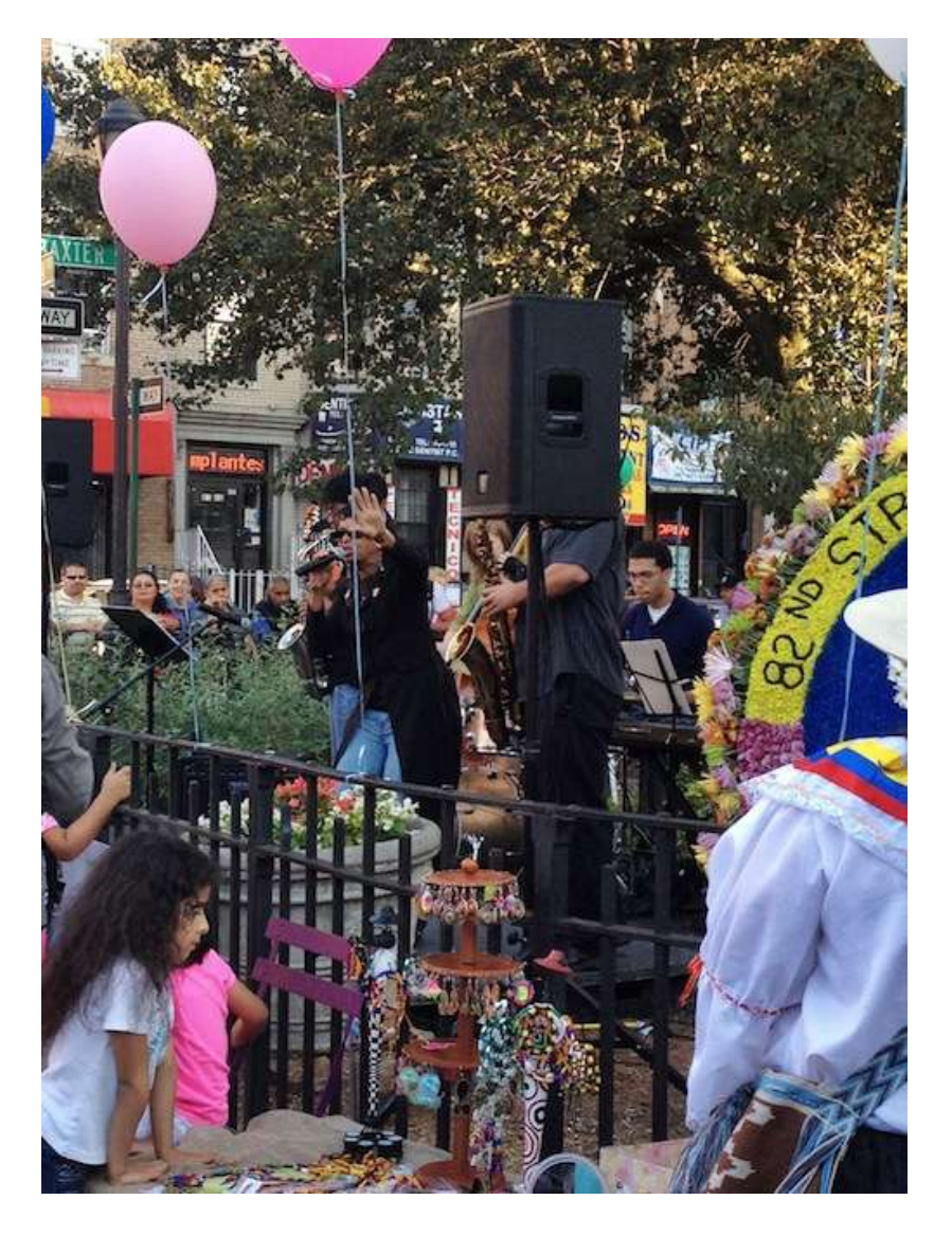
Overall, we thought this was a fantastic event and we look forward to seeing it again next year. Bravo to the organizers of Viva La Comida!